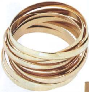
Wear delicate gold bangles in a stack.

Give your LBD a new-season twist with gold accessories - try a stack of bangles, a cocktail ring and a gold belt for instant glam.