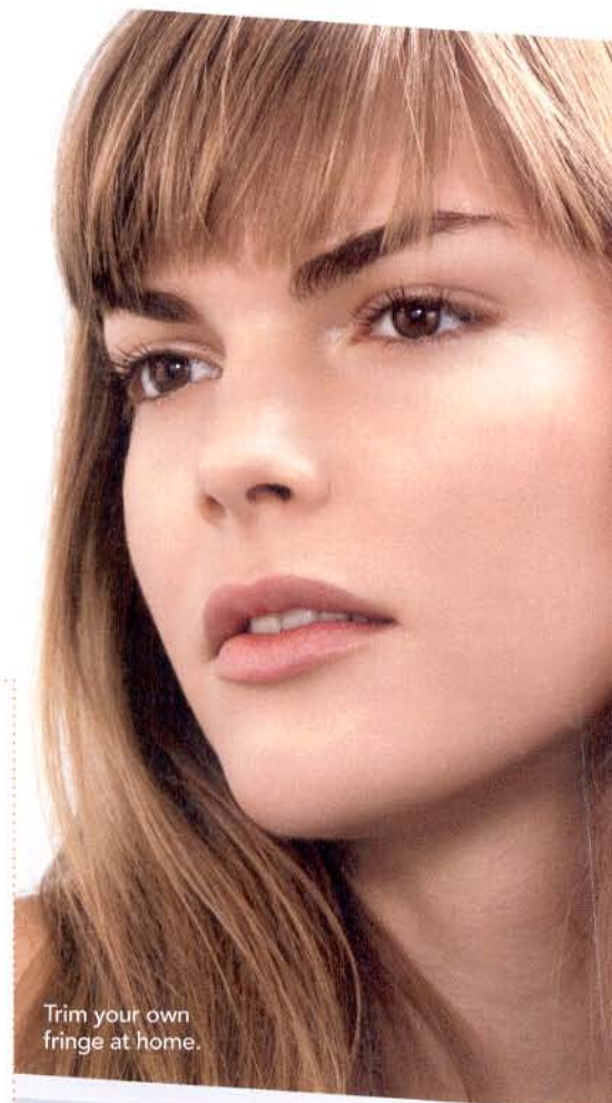
Trim your own fringe at home.

4 Do not pull hair away from your face as you are cutting or it will end up uneven.