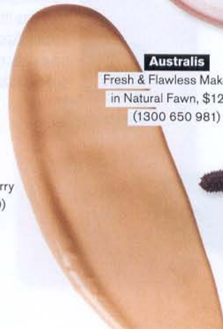
Australis Fresh & Flawless Make-Up in Natural Fawn, $12.95 (1300 650 981)