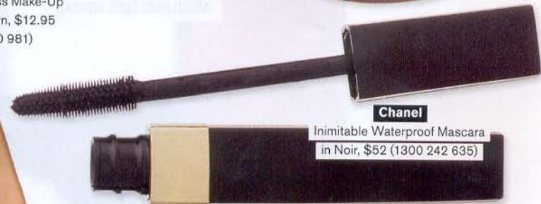
Chanel Inimitable Waterproof Mascara in Noir, $52 (1300 242 635)