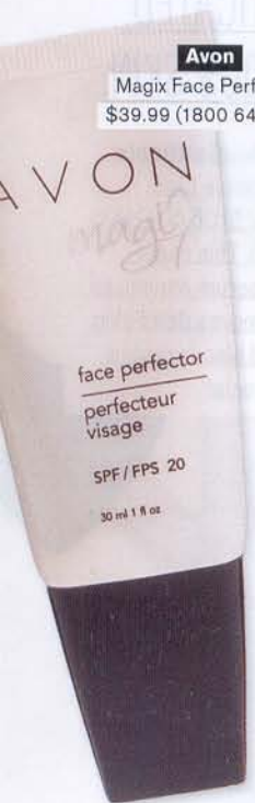
Avon Magix Face Perfector, $39.99 (1800 646 000)

TAKE YOUR CUES FROM THE CATWALK AND HIGHLIGHT YOUR BEST FEATURES WITH THESE WONDER-WORKERS.