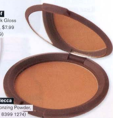
Becca Mineral Bronzing Powder, $64 (02 8399 1274)