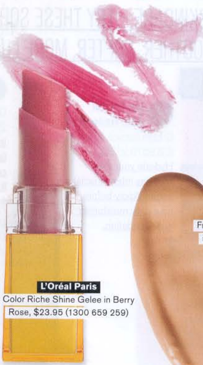
L'Oréal Paris Color Riche Shine Gelee in Berry Rose, $23.95 (1300 659 259)