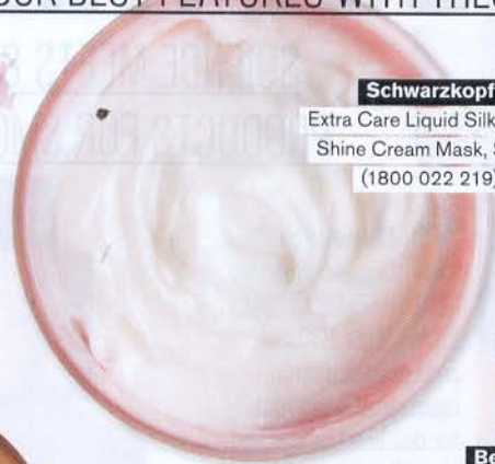
Schwarzkopf Extra Care Liquid Silk Gloss Shine Cream Mask, $7.99 (1800 022 219)